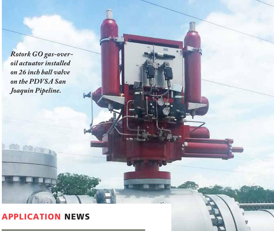
Rotork GO gas-over-oil actuator installed on 26 inch ball valve on the PDVSA San Joaquin Pipeline.