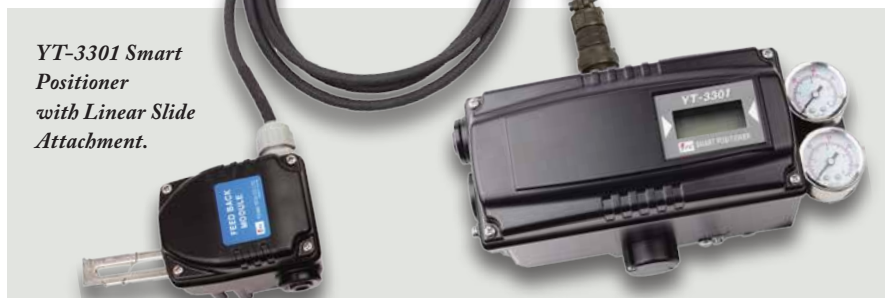
YT-3301 Smart Positioner with Linear Slide Attachment.

Most instrumentation positioners would fail early when subjected to these harsh environments. For example, smart positioners require internal electrical components which are extremely vulnerable at high temperatures and may prematurely fail when exposed. Young Tech Company (YTC) has developed two smart positioner products to thrive under these conditions which have paved the way to expansion and growth in tough process control applications.