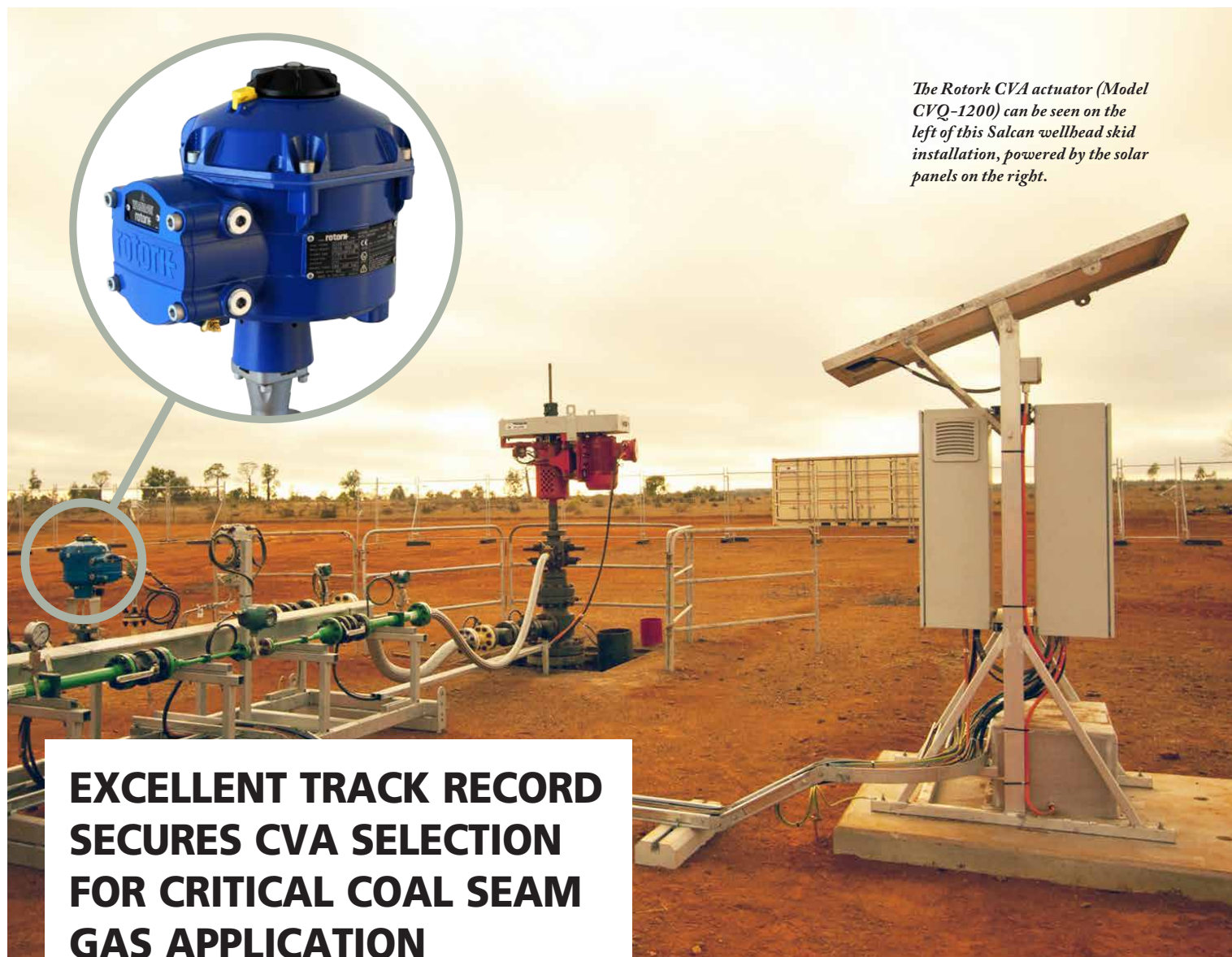
The Rotork CVA actuator (Model CVQ-1200) can be seen on the left of this Salcan wellhead skid installation, powered by the solar panels on the right.