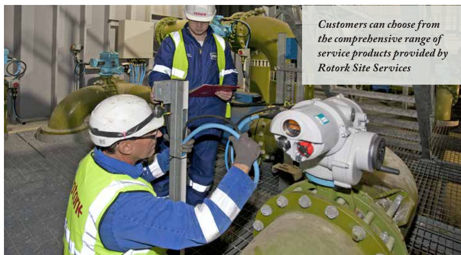
Customers can choose from the comprehensive range of service products provided by Rotork Site Services