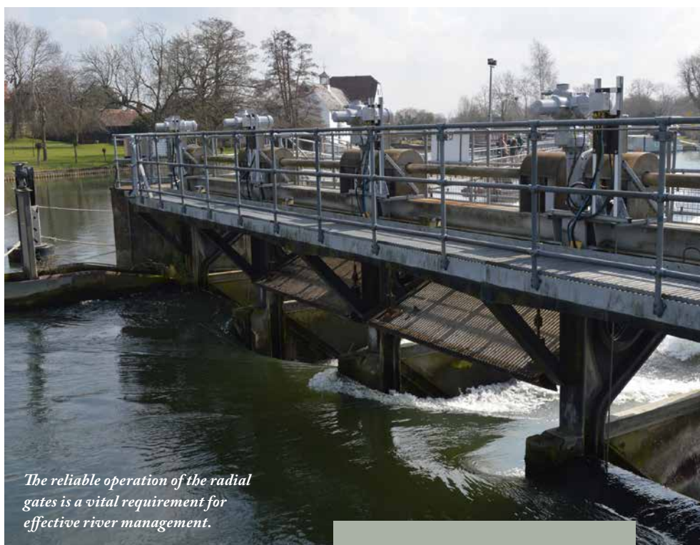
The reliable operation of the radial gates is a vital requirement for effective river management.

The sealing problems were aggravated by the design of the competitor's manual operating mechanism, which sometimes would not work against the heavy weight of large radial gates.