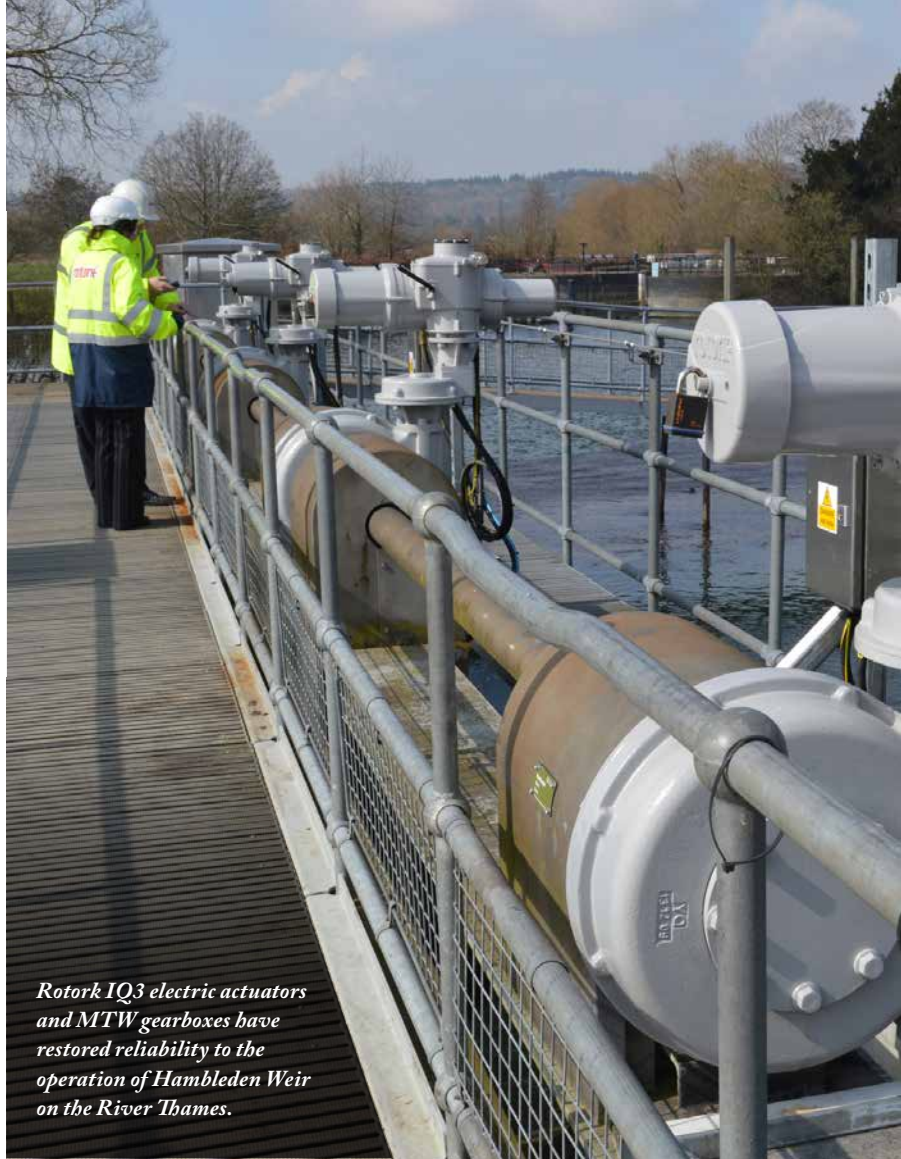
Rotork IQ3 electric actuators and MTW gearboxes have restored reliability to the operation of Hambleden Weir on the River Thames.

The Environment Agency had been encountering numerous reliability problems with the eleven electric actuators previously installed.